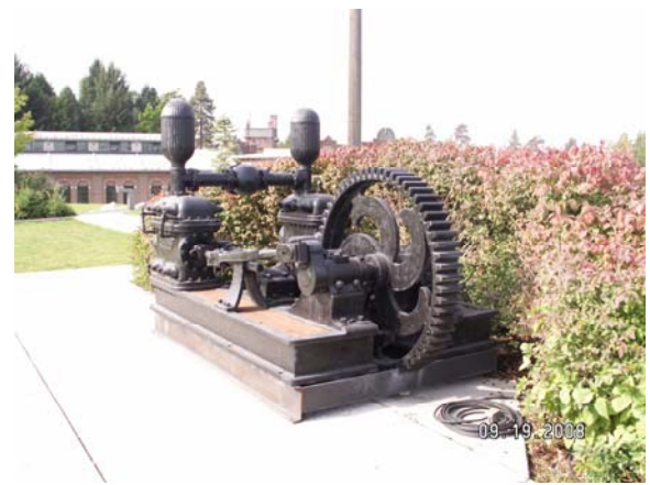
Times require new equipment & new ideas

Monitoring progress is particularly important when the goals are significant and the timeframes long. To get the most efficient processes, it is important to measure results, learn from others and adapt along the way. Committing to continuously improve in all policy and process helps assure good stewardship and facilitates achievement of goals. For these reasons, we recommend that the City: