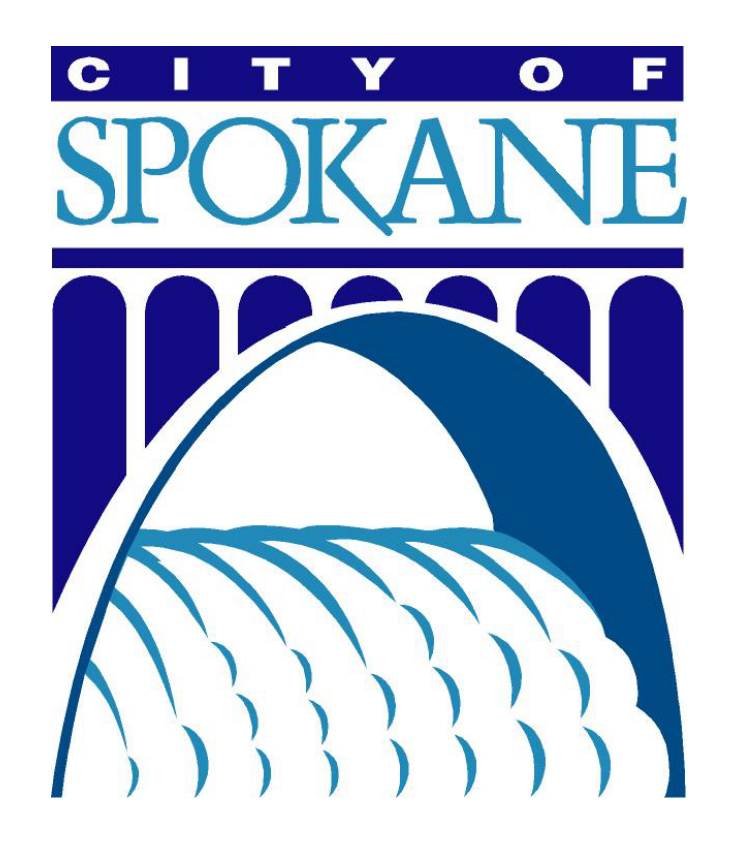
Sustainability Action Plan: Addressing Climate Mitigation, Climate Adaptation, And Energy Security