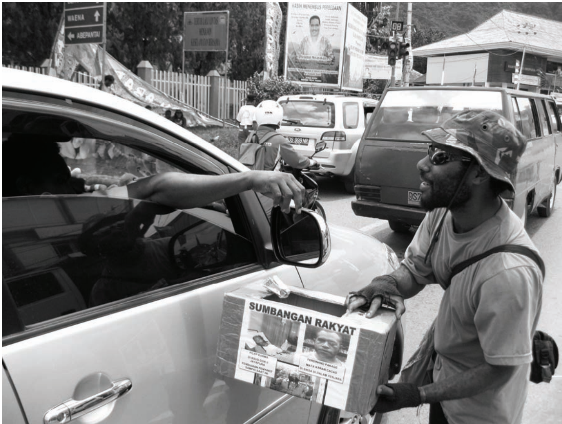
A student activist holds a donation box to help political prisoners at an intersection in Abepura, March 2010. The Indonesian Ministry of Law and Human Rights refused to send political prisoners for necessary medical treatment on the grounds that it could not cover the costs.

permit. 39 Karma told Human Rights Watch, “I used to be a bureaucrat myself. But I have never experienced such [use of] a red tape on a sick man.” 40