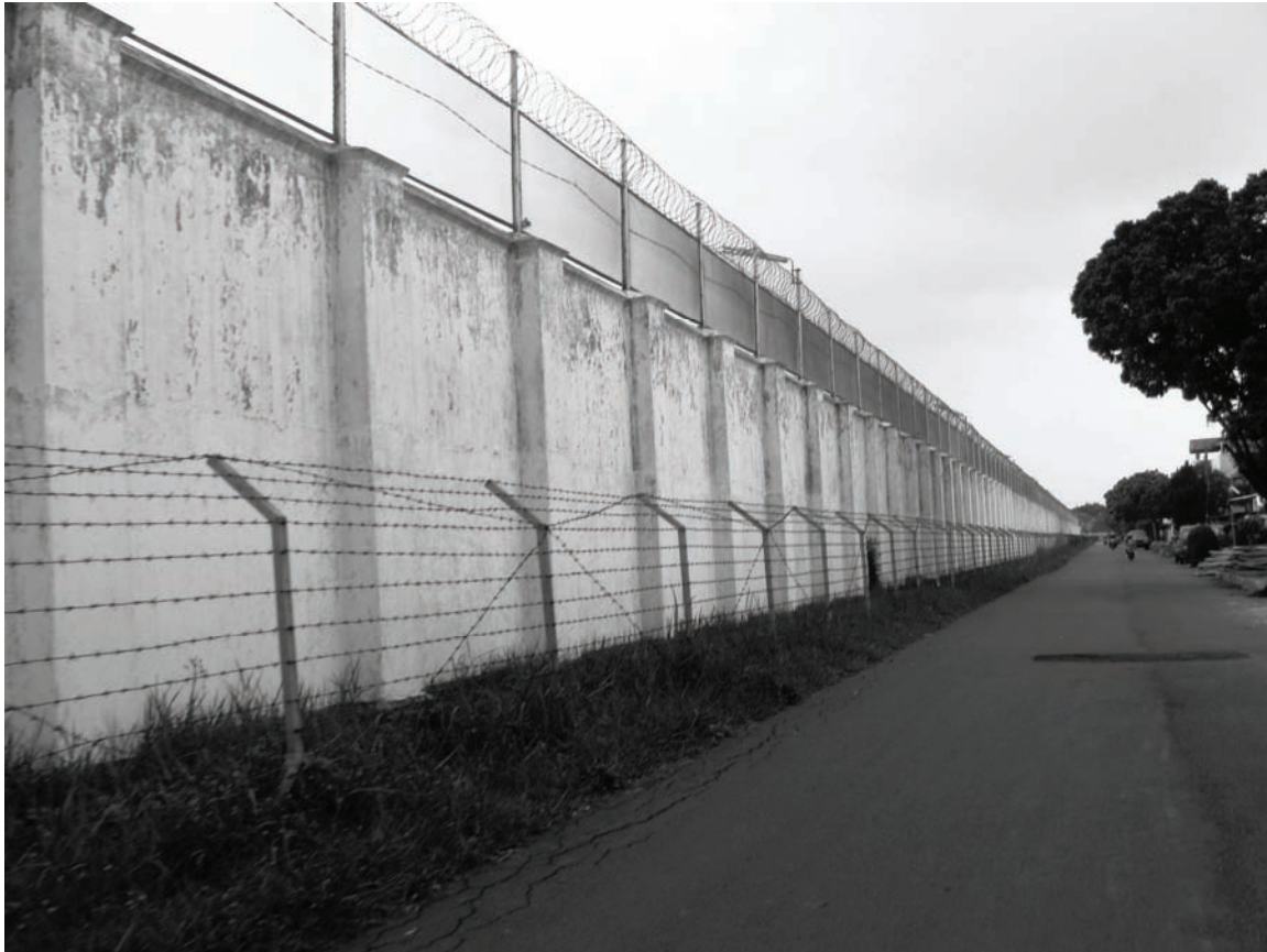
Lowokwaru prison in Malang, East Java, where six RMS political prisoners are currently imprisoned. Prisoners are not provided with safe drinking water and instead must drink unhealthy prison tap water. Some still suffer from health problems caused by police beatings during interrogations in Ambon in 2007.