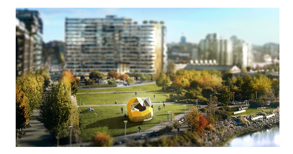
Figure 1: Artist rendering of Dogethereum [2].

and possibly even Litecoin miners who incidentally mine Dogecoin as well. Indeed, any change in consensus procedure requires a so-called "fork" wherein miners each voluntarily update their local clients.